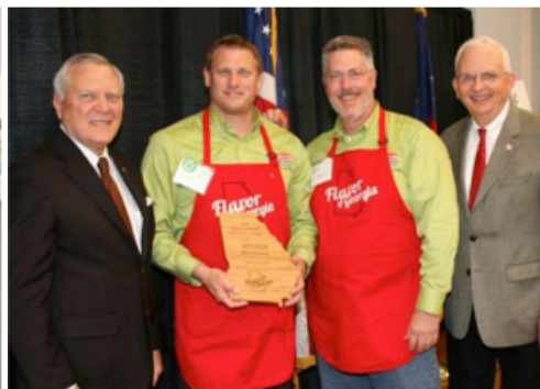
Hardy Peanuts , another GAC Member, taking home a prize during the Flavor of Georgia Award Ceremony.

Georgia Seed Association Inc. Georgia Vocational Ag. Teacher Association Georgia Watermelon Association Georgia/Florida Soybean Association Gillis Bros. Inc. Growers Gin & Warehouse, Inc. Growers Supply Inc. Hattaway Farms Partnership International Forest Company, Inc. J & B Irrigation Inc. KAKEGA LLC Leger & Son, Inc. Majors Electric & Mechanical Co., Inc. National Peanut Buying Points Association Pike Creek Turf, Inc. Quality Gin, Inc. Sanders, Inc. Southeastern Cotton Ginners Assn., Inc. Southern AGCOM Inc. Southern Crop Production Assn. Southern Equipment Dealers Association Southwest Georgia Farm Credit The Produce Connection Inc. Triangle Chemical Co. TriEst Ag Group, Inc. United Egg Marketing Corp./Dixie Cattle Co. Viridium Products Woodruff & Howe Env. Engineering, Inc.